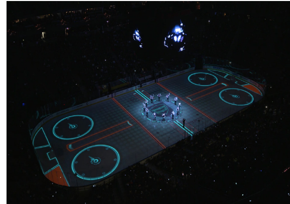
▲ Drumbots' Knight Line perform during intermission.