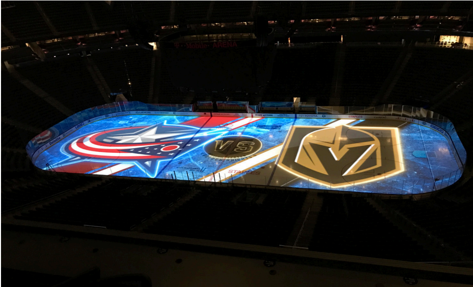
▲ Projection mapping on ice wows fans before the game.