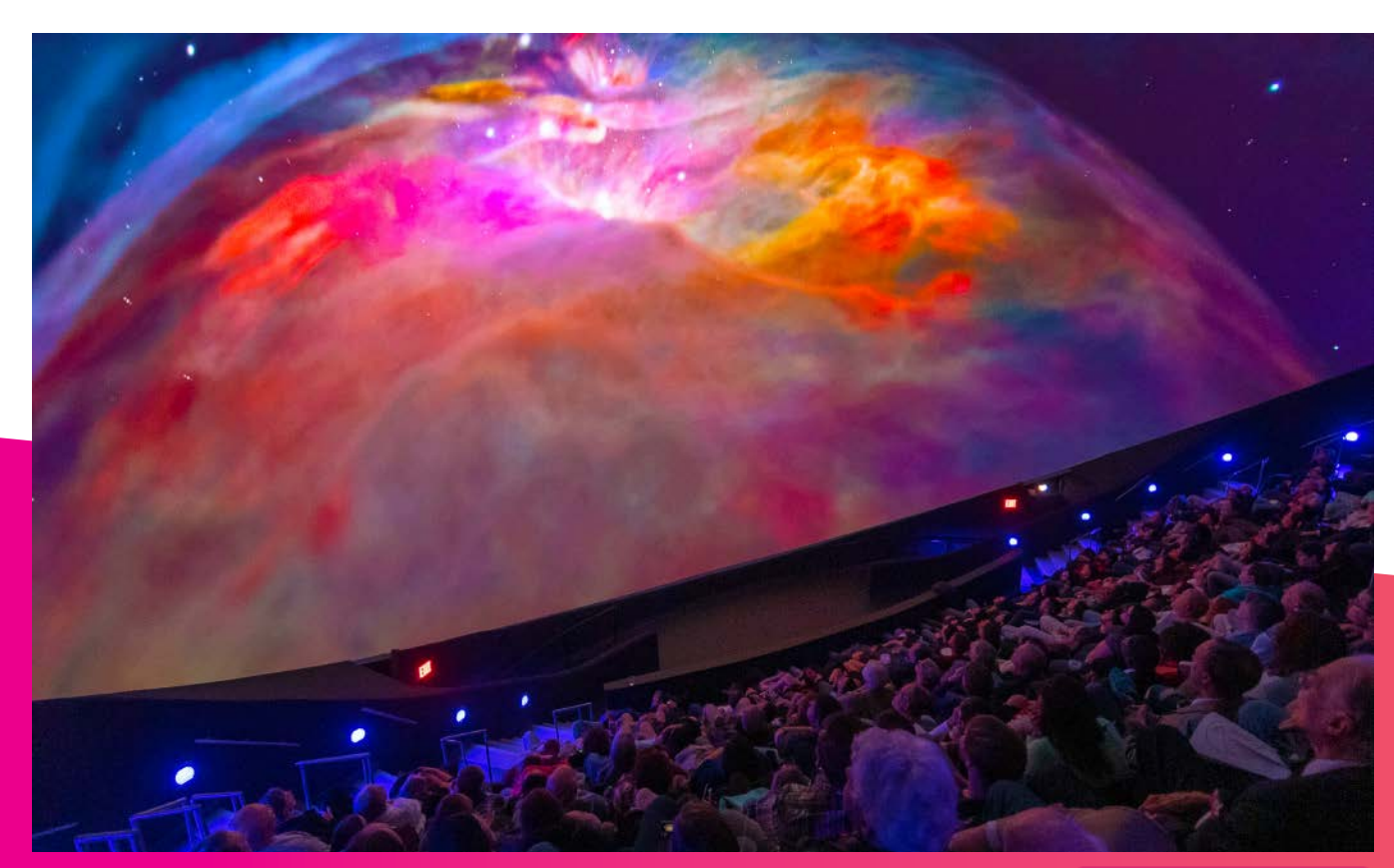
US Space and Rocket Center

Leading the charge in innovation is Christie®. With a product range that includes unique, cutting-edge RGB pure laser projectors, high-performance lamp-based projectors, immersive audio systems, and all the auto-alignment, processing and show control tools needed to reliably and consistently put on the best presentation possible, Christie is your first choice for your next build or theater upgrade.