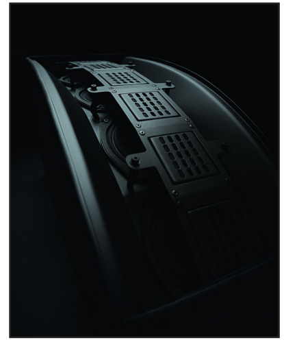
▲ The Christie LA3S surround speaker combines ribbon driver technology with a unique parabolic line array design.

Comprising a variety of screen channel and surround speakers, subwoofers and Class D amplifiers, as well as an audio/video processor, Christie Vive Audio is a complete solution. At the core of Christie Vive Audio is the combination of Christie ribbon driver technology and line array speaker design. This combination offers superior audio performance compared to traditional point source compression driver-based speakers typically deployed in movie theaters. It represents the ideal platform for immersive cinema audio formats, such as Dolby Atmos.