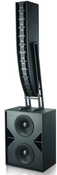
▲ The Christie LA3 speaker, when combined with the Christie S215 subwoofer, creates a 3-way, bi-amplified, full range system.

Contact us today to find out how your organization can benefit from Christie solutions.