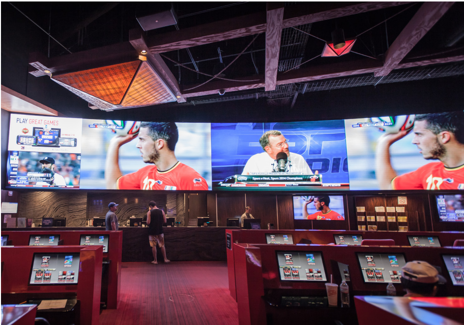
▲ A Christie Velvet LED display envelops a wall at Silverton Casino Hotel providing a rich and dynamic platform for the casino's sports book.