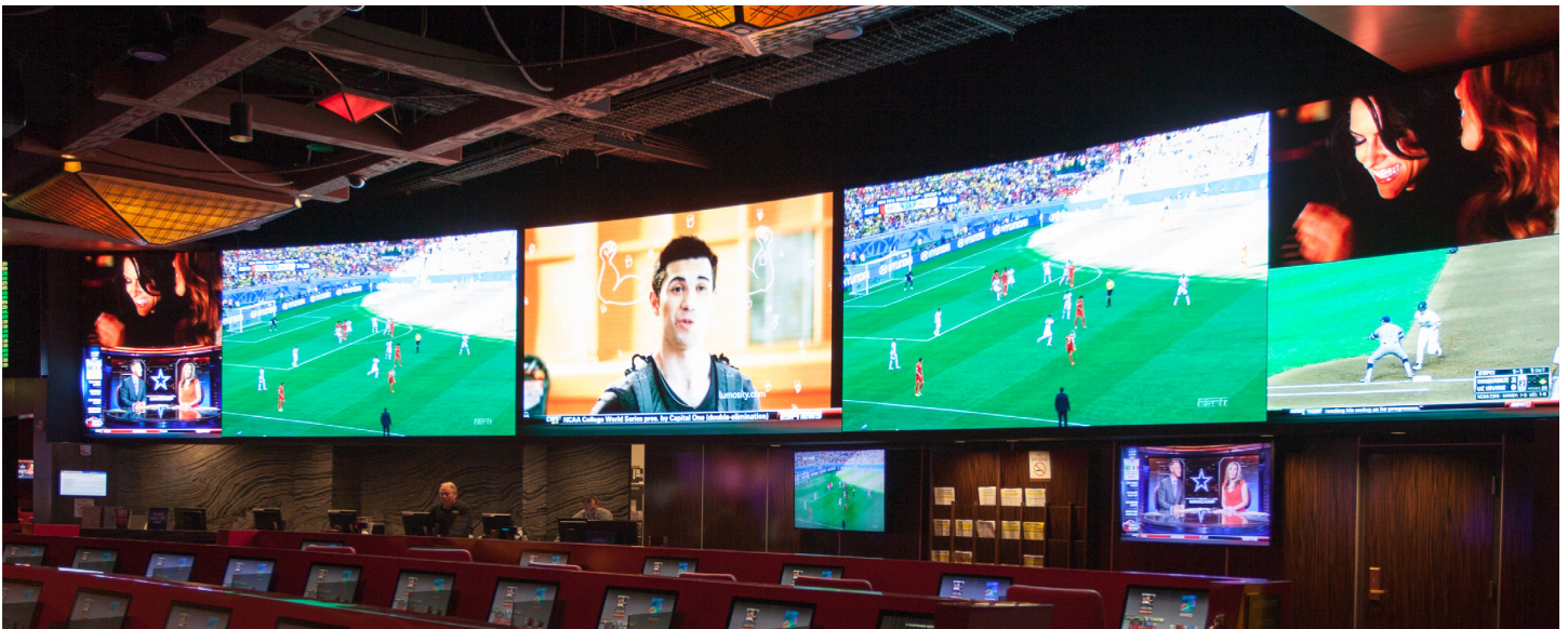
▲ The Silverton Casino Hotel sports book is able to broadcast multiple channels simultaneously, ensuring customers stay up to date with relevant information.

Featuring true 24/7 operation, Christie Velvet LED provides a brilliant digital canvas that is easy to install, operate and maintain. Based on efficient LED illumination, Christie Velvet is a low-energy, long-life platform for display walls in any indoor setting. Producing 281 trillion colors, a full-field contrast ratio of 3,000:1 and brightness levels up to 1,000 nits, content displayed on Christie Velvet enables a fantastic viewing experience.