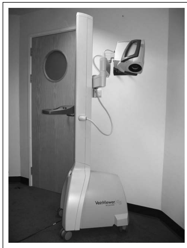
Fig. 1. Mobile vein imaging system.

Fifty questionnaires were completed between June 1, 2009, and March 31, 2010: 11 by consultants, 16 by registrars, 20 by senior house officers, and 3 by nurses. They had been taught how to use the Vein Viewer by a colleague (n = 37) or by reading the instruction manual (n = 13). A calibration was carried out once every morning, which lasted <5 min. After that, it took about 1 min to switch on the device. No additional patient preparation was necessary. Of the 50 patients, 38 had blood drawn for diagnostic purposes, and 12 had a cannula inserted for intravenous treatment. The mean age of the