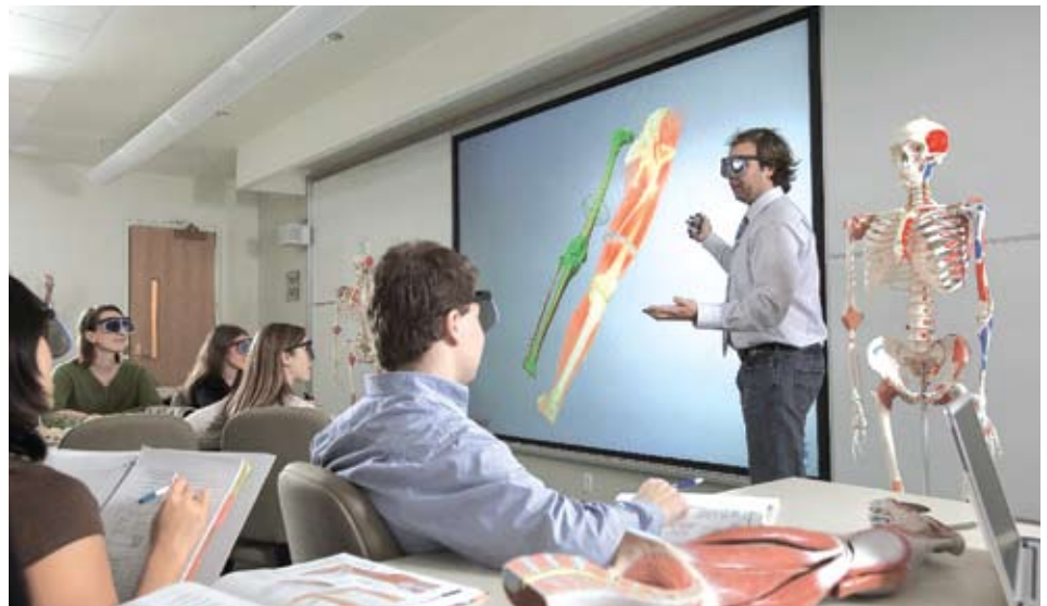
▲ The University of Western Ontario, Faculty of Health Sciences, Virtual Reality Theater.

Active stereo projectors 3-chip 0.95" Darkchip3™ Variable contrast up to 2000:1 Up to 60Hz input for both stereo and mono content Up to 120Hz output Broad source compatibility – both stereo and non-stereo Christie Twist (internal enhanced image warping and edge-blending module option) Horizontal, vertical lens shift