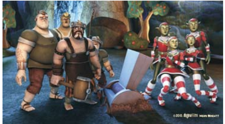
Spain's first digital 3D animated film "Holy Night!"