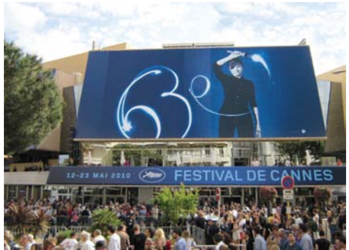
Over half of the theatres used for the Cannes International Film Festival were equipped with Christie Solaria Series digital projectors