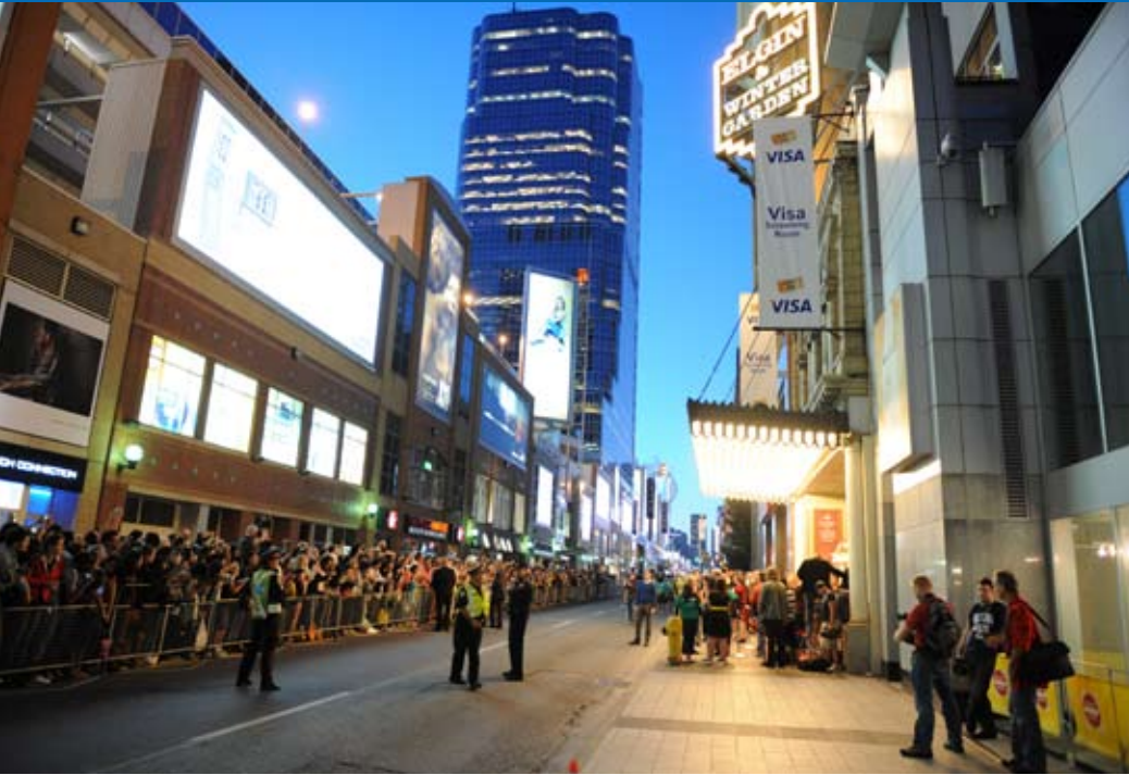
VISA Screening Room at the 2010 Toronto International Film Festival