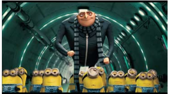
Universal's first 3D animated film "Despicable Me"

The 58th film festival, that took place in September 2010, presented over 200 films from 46 countries and hosted over 165,000 attendees. The two 3D movies shown on a giant screen measuring over 1,300 sq ft (400m 2 ) at the Antonio Elorza Velodrome theater were Universal's first 3D animated film, "Despicable Me," and the world release of the Spanish digital 3D animated film "Holy Night!".