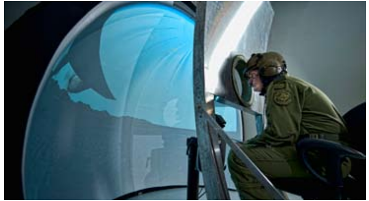
The first rendition of the Hercules Observer Trainer (HOT) had only one projector. By having two projectors and a larger screen the second HOT has increased resolution and field of view.

DRDC also wanted to incorporate infrared projection and NVG technology. "The Christie Matrix StIMs provided NVG capabilities, as well a stable system where light levels could be controlled. This was very important in an NVG environment. Furthermore, focal distance was an issue, so we improved this