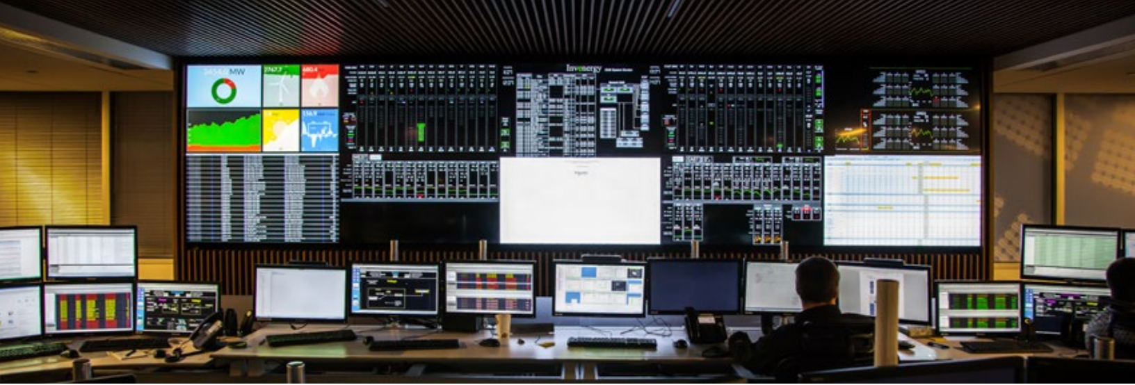
^ A Christie LCD video wall and Christie Phoenix content management system powers the control room at Invenergy's Chicago headquarters.