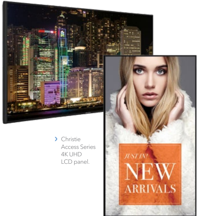
› Christie Access Series 4K UHD LCD panel.

When you want to make a really big impact, choose the Christie FHQ981-L. This 98" UHD display comes with a number of proAV features and is the ideal seamless display for meeting rooms and digital signage applications.