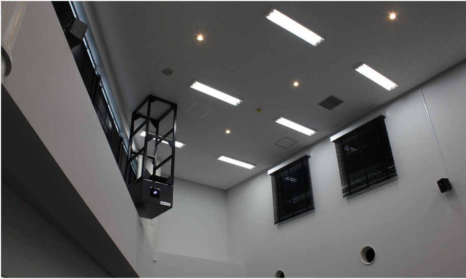
▲ The Christie HD10K-M projector installed at Yamagata University's conference room.

10,000 lumens. The Future Hall of the university also deploys a 140" screen, accompanied by a Christie GS Series projector. High brightness projectors providing various field views are extensively used in universities where lecture halls and large conference rooms are situated, hosting a wide array of events such as lectures, academic conferences and symposiums. The university is considering opening access of these venues to local residents, to enable them to utilize the spaces and wide screens available.