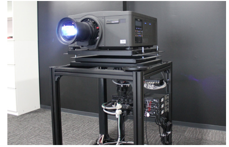
▲ The Christie Mirage HD6K-M projectors are used to offer a highly immersive experience through the CAVE system.