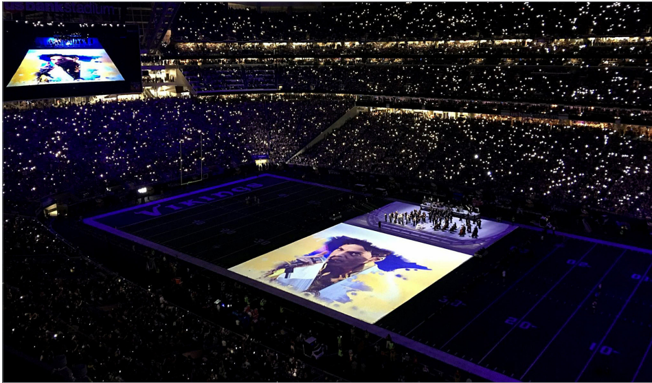
▲ The Minnesota Vikings pay tribute to the late Prince with a projection mapping half-time show