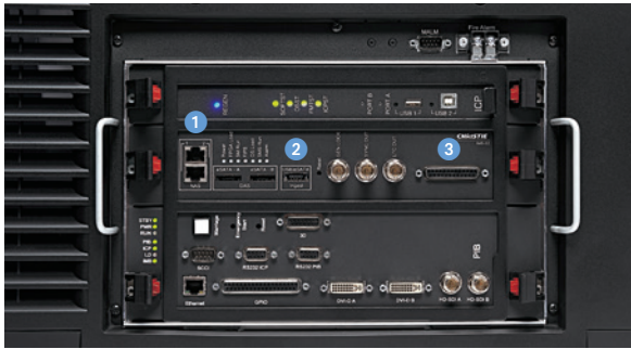
▲ Christie IMB-S2

With more than 80 years of experience meeting and exceeding exhibitor needs and requirements, Christie will be around to provide support for the lifetime of this product