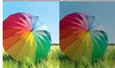
Optically bonded Corning® Gorilla® Glass