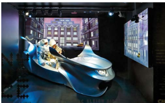
◀ Christie LCD displays helped bring Barneys New York window displays to life for an innovative retail shopping experience